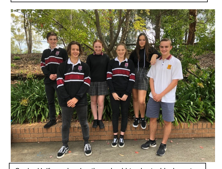
Senior Uniform showing the polo shirt , shorts, black pants and jeans, plain black jumper and the Year 12 jersey.