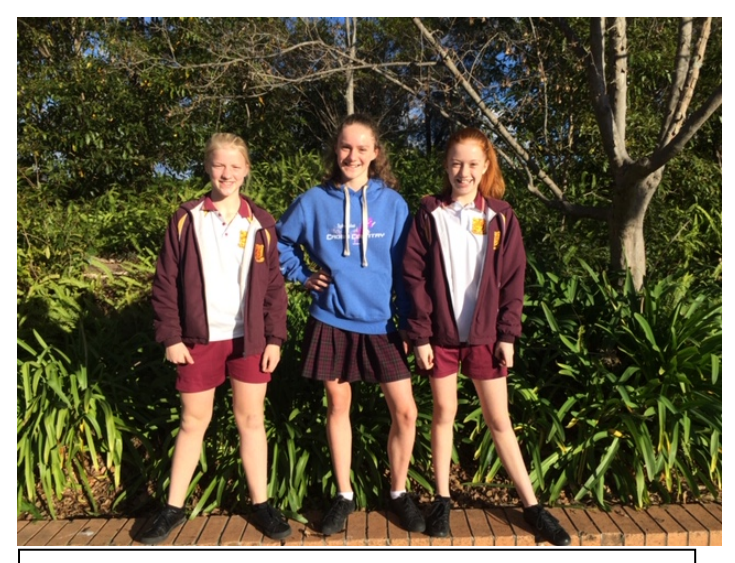
Sports uniform showing the sport polo shirt, sport shorts and the microfiber jacket. An example of a Team Representative jumper which can be worn on Fridays.