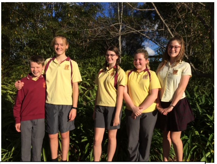
Junior Uniform showing the skirt, shorts, pants, sloppy joe, polo shirt and buttoned blouse.