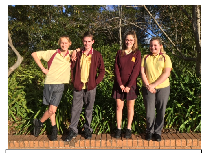
Junior Uniform showing the skirt, shorts, pants, polo shirt, wool jumper and plain maroon jacket.