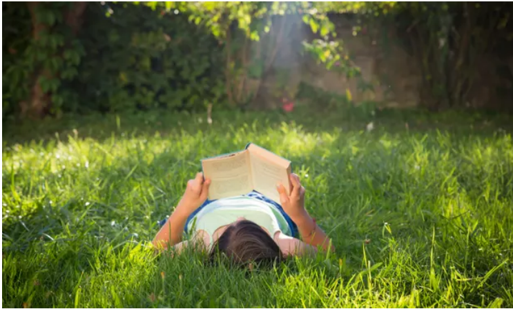
'Multiple studies show that digital screen use may be causing a variety of troubling downstream effects on reading.'

Karin Littau and Andrew Piper have noted another dimension: physicality. Piper, Littau and Anne Mangen's group emphasize that the sense of touch in print reading adds an important redundancy to information - a kind of "geometry" to words, and a spatial "thereness" for text. As Piper notes, human beings need a knowledge of where they are in time and space that allows them to return to things and learn from re-examination - what he calls the "technology of recurrence". The importance of recurrence for both young and older readers involves the ability to go back, to check and evaluate one's understanding of a text. The question, then, is what happens to comprehension when our youth skim on a screen whose lack of spatial thereness discourages "looking back."